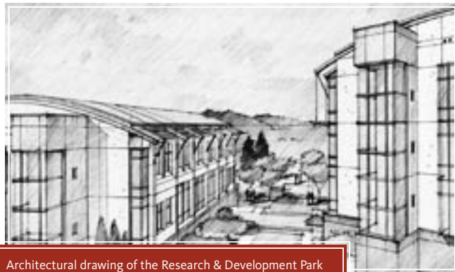
Architectural drawing of the Research & Development Park

The new Health Sciences Centre and Research & Development Park will provide some opportunities for offices and classrooms to vacate the Library building, making room for the growing Library collection. Expanded space for the Archives of Northern BC and a new education resource lab to accommodate students in the Bachelor of Education program are two of the results. Meanwhile, access to electronic resources, the internet, and catalogue will move to an expanded “Information Commons” area on the first floor of the Geoffrey R. Weller Library. The UNBC Library has been growing at a rapid rate: no other university in Canada devotes a higher percentage of its budget to new acquisitions.