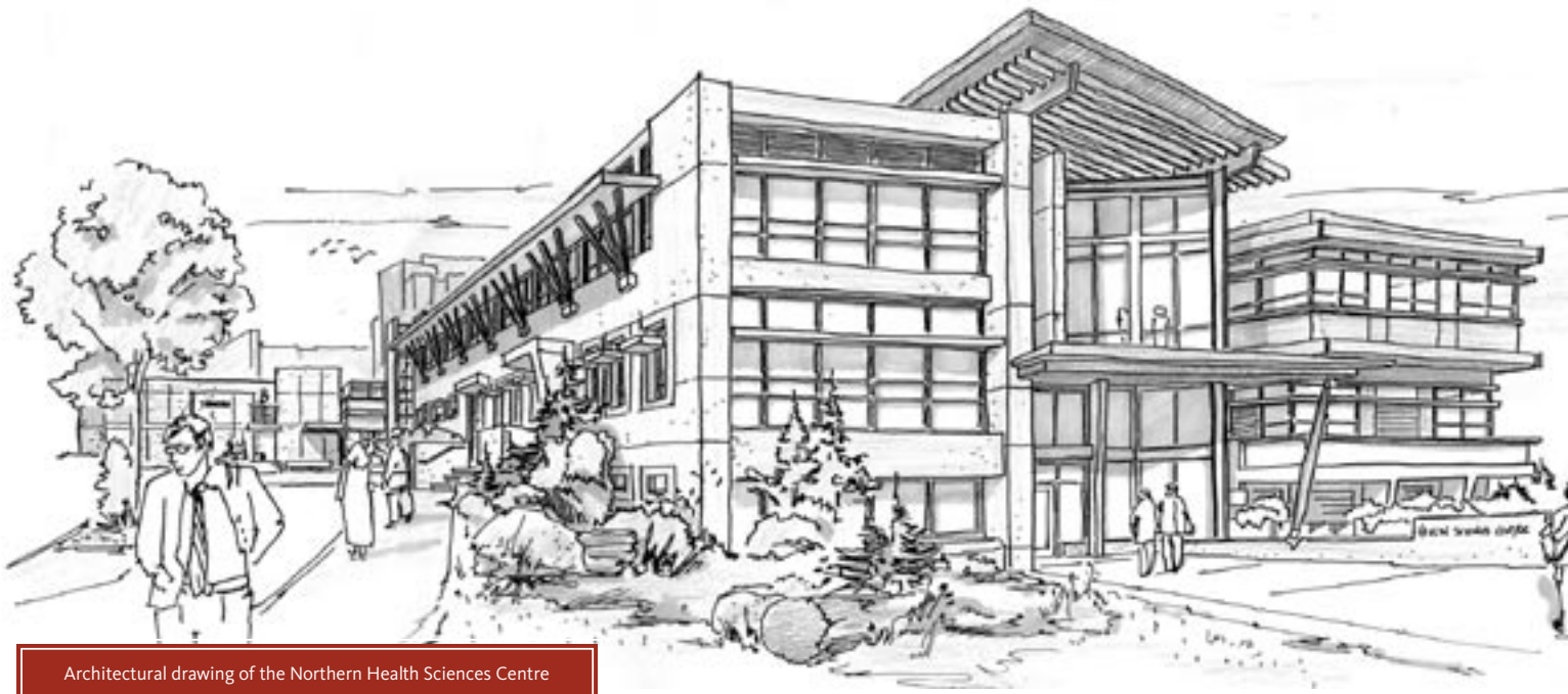
Architectural drawing of the Northern Health Sciences Centre